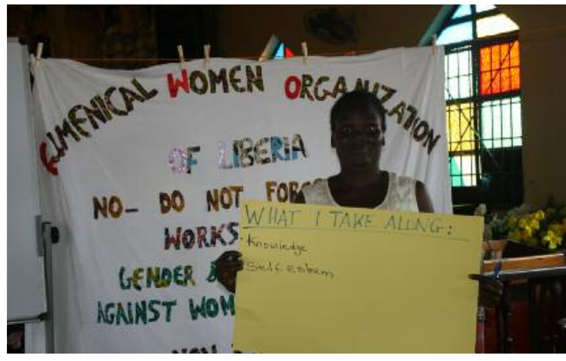
A participant from a EWO workshop on Gender Based Violence