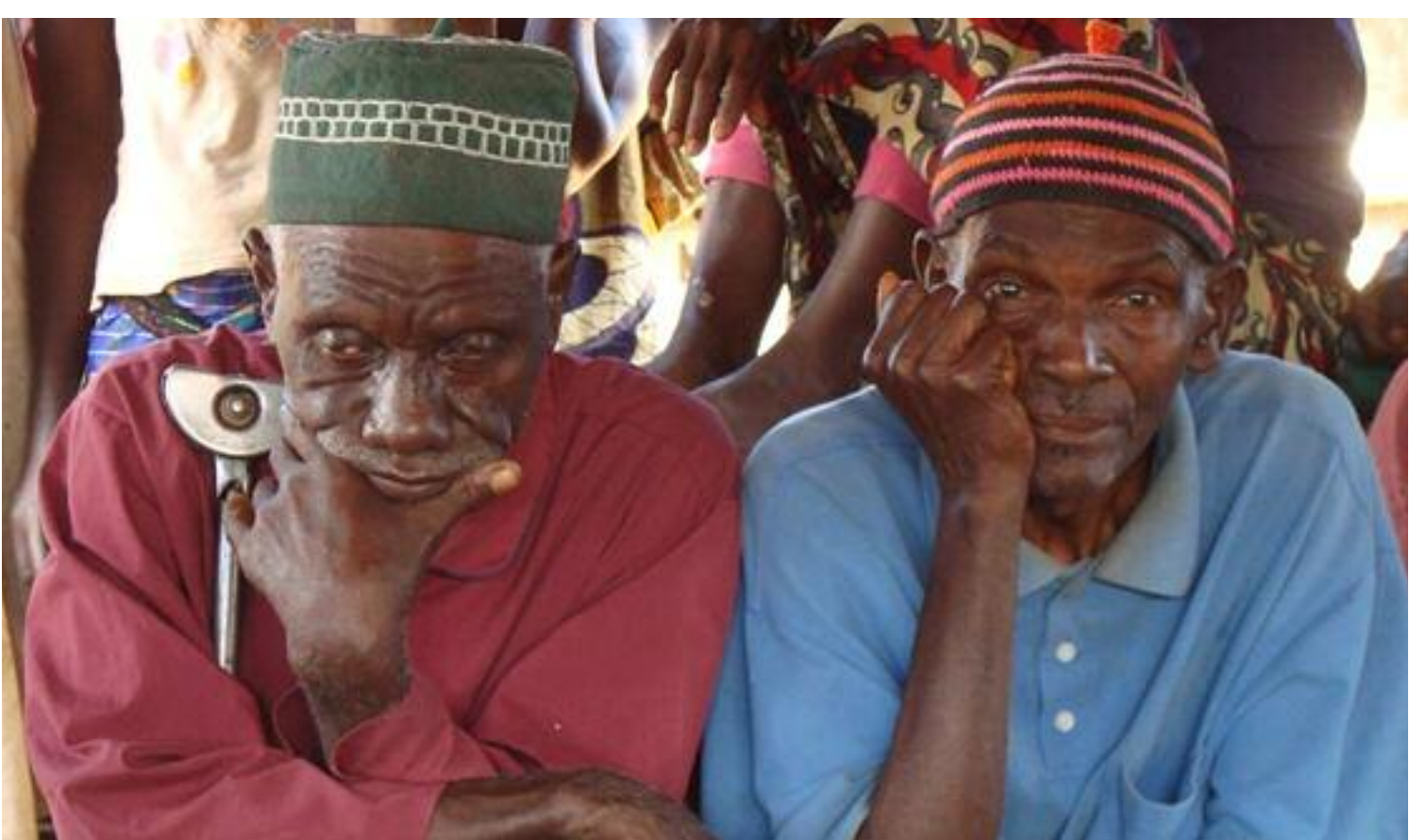
Community members in Sierra Leone - the frustration about the recent developments is written in the faces of the people.

Dialogue could certainly help in both the case of Kemedugu and ADDAX.