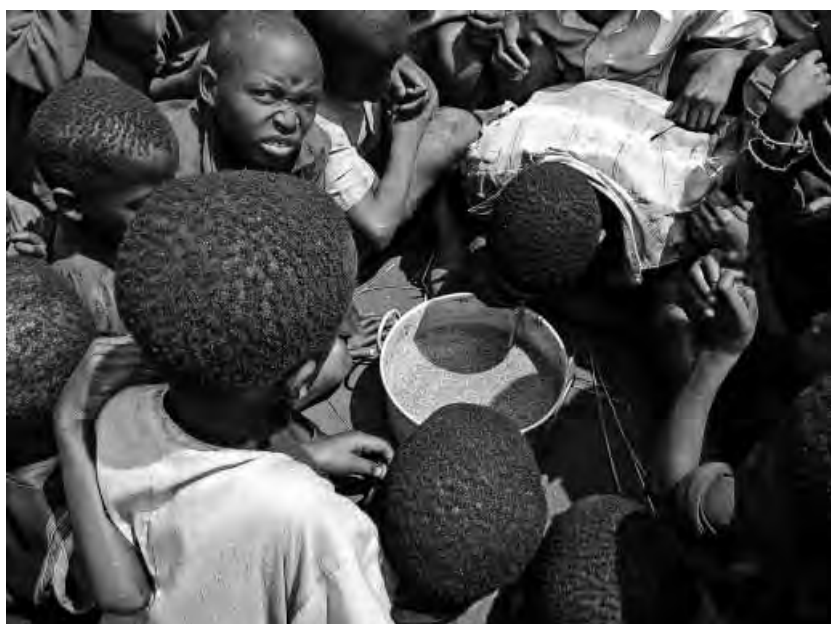
Community Reconciliation is everyone's business: here, men, women and children from Mubuga (Gitega)