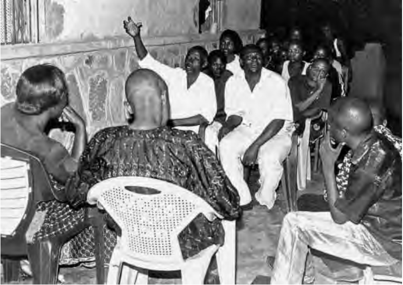
NAPO discussion on how to rebuild Ngadi market