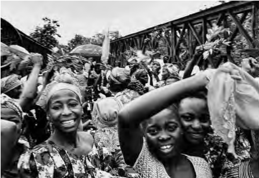
Maniema women rejoice: the struggle for their rights takes a step forward