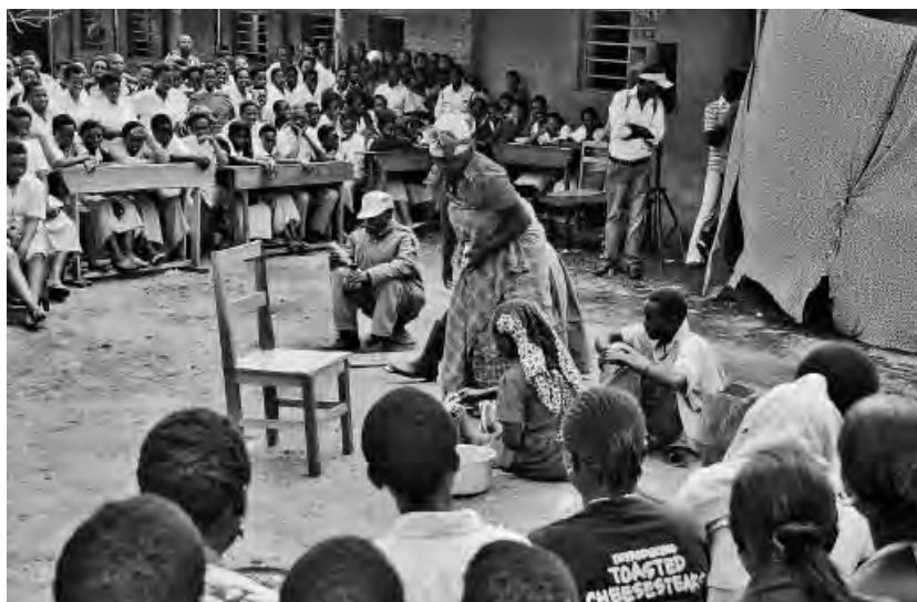
Theatre forum at the secondary school in Gisenyi