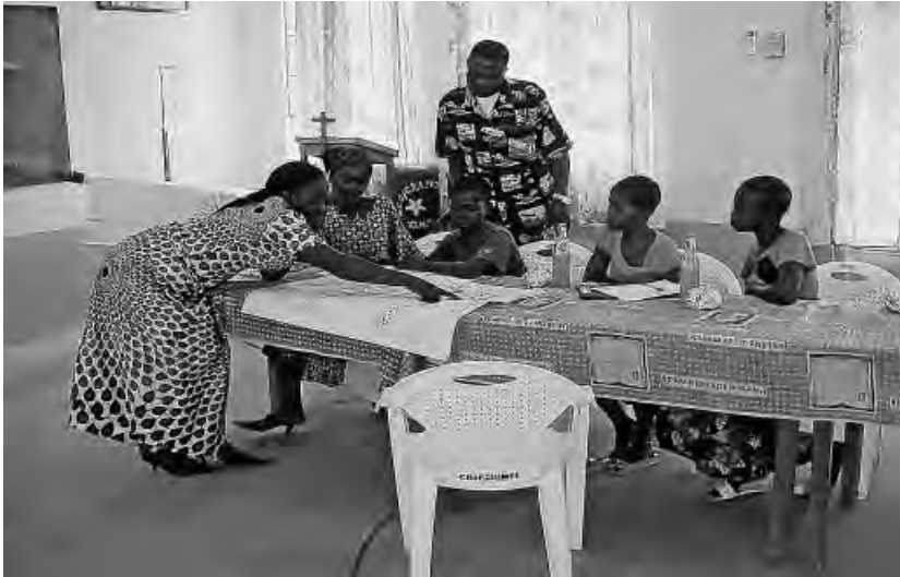
Analysing context with the group of teenagers. "La Parole aux Jeunes" (Let Youth Speak Up).

The one-day event organised by CRAFOD last March called " La Parole aux Jeunes/Let young people speak up " allowed the young people of