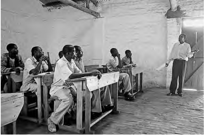
“The Path of Peace” in a vocational training centre for young carpenters.