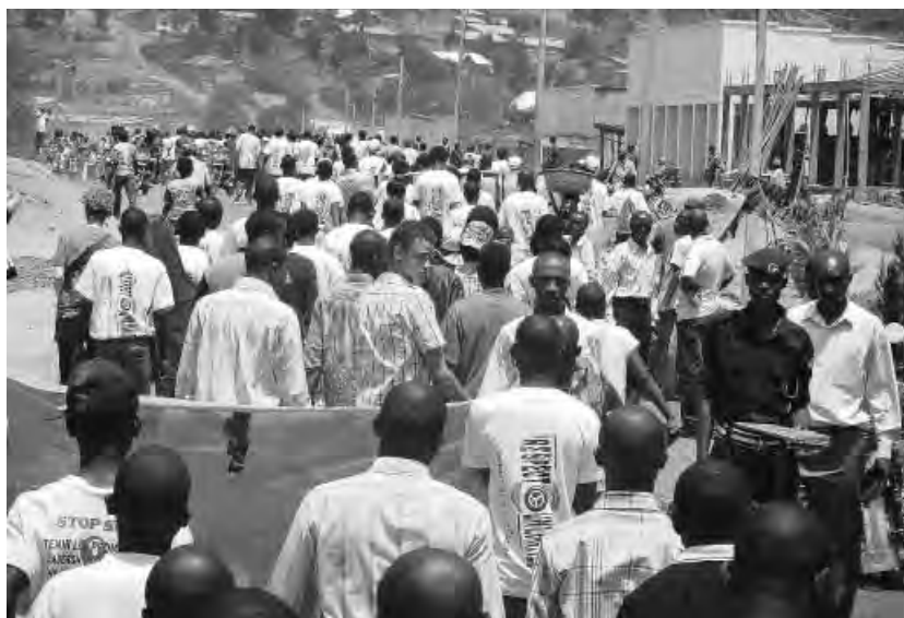
Respect without borders: March for Peace on the occasion of World Peace Day 2010