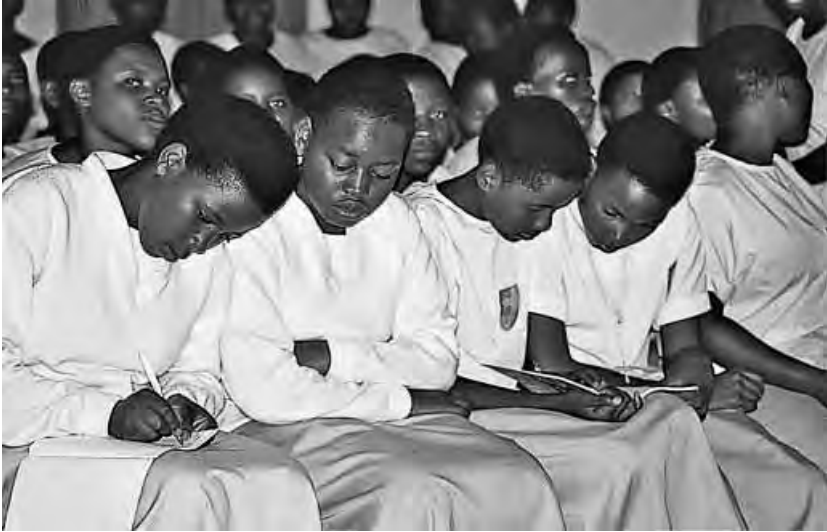
“The young pacifists”: Young ambassadors of the message of peace at the catholic school in Nyamasheke.

The testimonies are part of the long-term, a network that can only exist if it draws on reality, just as peaceful cohabitation cannot exist without a place for it to happen. The testimonies, programmes, meetings, studies, training sessions, drawing up of new tools, etc., can only be effective if they are brought together in a shared space which we shall call the House of Peace. Let us not just keep on talking about testimonies, let us build this House of Peace.