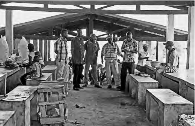
Residents of Nzanza district discuss their problems at a proximity meeting