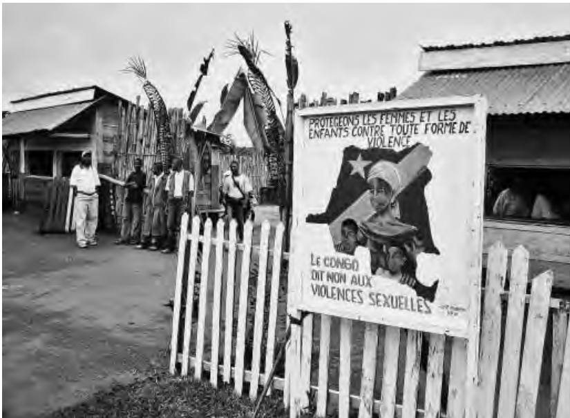
La Maison des Femmes (The Women's Centre) – Wamama Simamemi in Lubutu

The work of the Civil Peace Service (CPS) in the Democratic Republic of Congo comes up against a culture of violence and a system of impunity which present enormous challenges. Women of all ages, young girls and even children are the victims of rape and other forms of sexualised violence. These practices are committed by armed men, but also by civilians. An increasing number of men are also becoming victims. HEAL Africa, an organisation based in Goma in North Kivu, works in