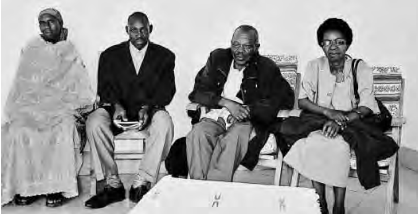
Mediators of Justice and Peace in the parish of Rugari