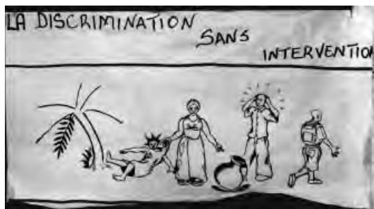
PeaceWeek 2010 A participant's drawing