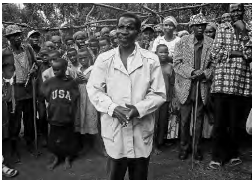
Public testimonies of people reconciled at Ruhororo after the 1993 crisis