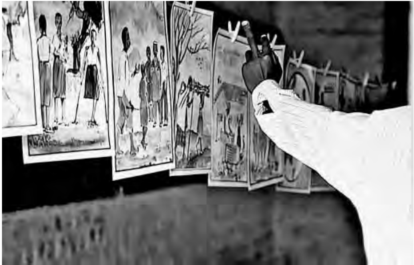
“The path to children’s rights”: Pictures are used as a basis for discussion.