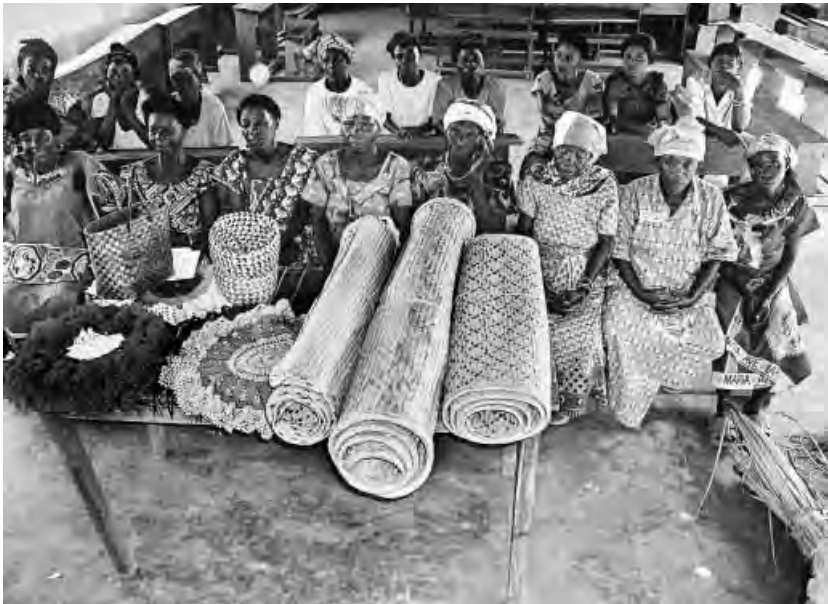
A group of “mamas” from Women’s Dynamics in the parish of Saint Joseph de Kilibi and their products

These women choose the topics themselves, often after training