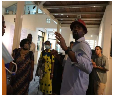
Doual'art production aimed at communicating social cohesion and the preservation of historical heritage

Major take home from the presentations of coordinators from Sierra Leone, Liberia and DRC were: