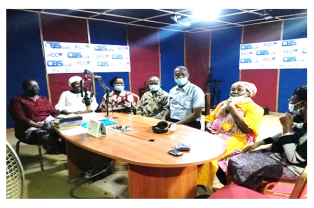
Participants at a radio programme (CBC radio station, Buea)