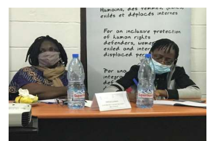
CPS Cameroon, Doual'art stands unique in implementing a participatory approach to cultural practice, negotiating with local communities. This non-for-profit cultural organization and art center which was founded in 1991 in Douala focuses on new urban practices of African cities.

It is a contemporary art center and an experimental space for new urban practices. Its artistic policy is centered on providing services and support for artist who are interested in urban concept through their work and research. Since inception, the art lab has offered over twenty pieces of public art that inform people on the history of Douala.