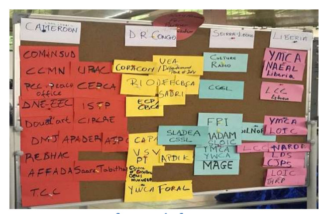
Ways forwards for partners

CPS in this country uses education for peace, with focus on young persons in and out of school, clubs and the need for living together to promote its agenda, giving a voice to the voiceless. In all, participants were called upon to seek best practices in the promotion of peace: ecumenical approach and inter-religious dialogue; the bundle and cluster approaches; implication of women / youth /vulnerable in Peace building process; encouraging transgenerational dialogue; and collaboration between government and civil society.